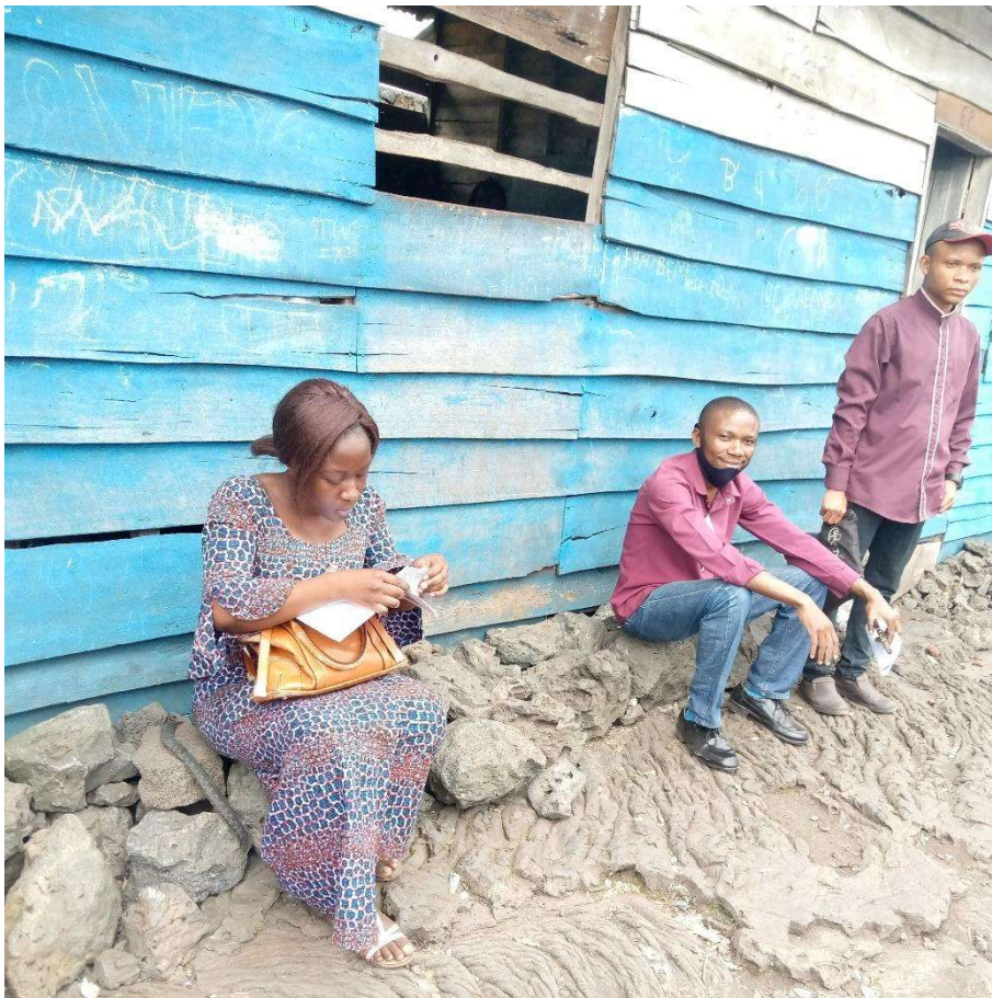
During break time (10 minutes), teachers have no other option rather sitting on stones because there is no staff room.