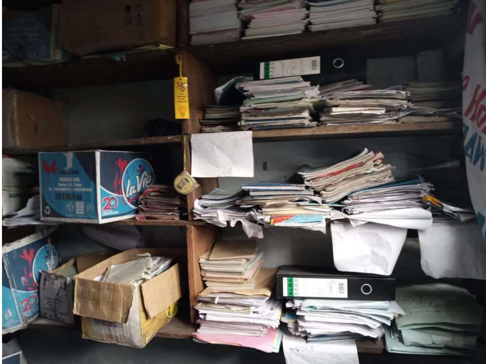
Inside the school office: Old books (most of them are outdated), no good shelves to store the school materials