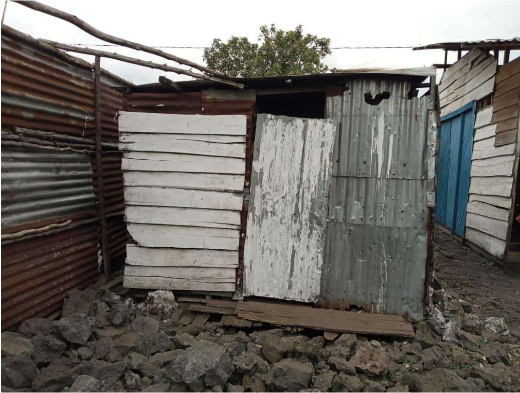
Front side of the school toilet. There is only one two-door toilet for both girls and boys. Unfortunately it is not well built. It is risky; it is possible to spread diseases.