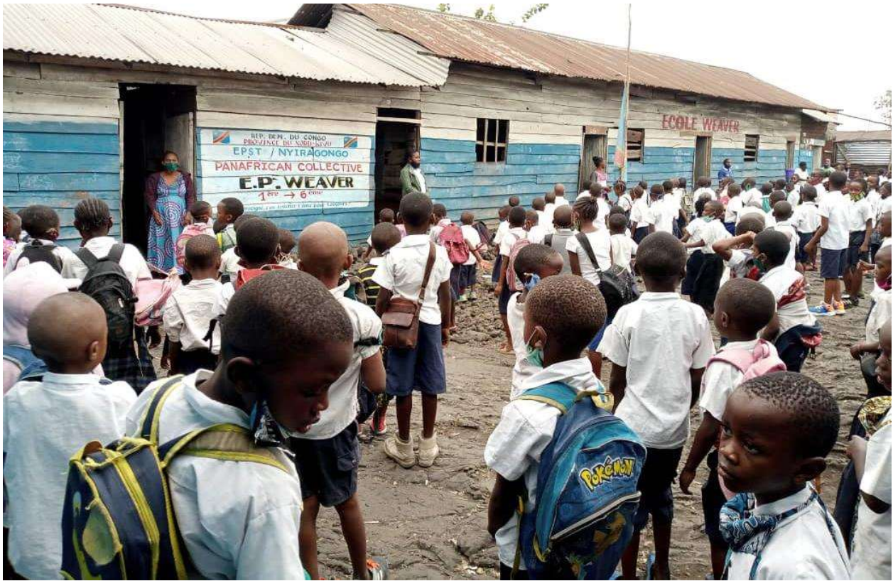
Every morning, students are asked to line up for a morning prayer and sing the National Anthem, a strategy that teach them the love for God and their Country.