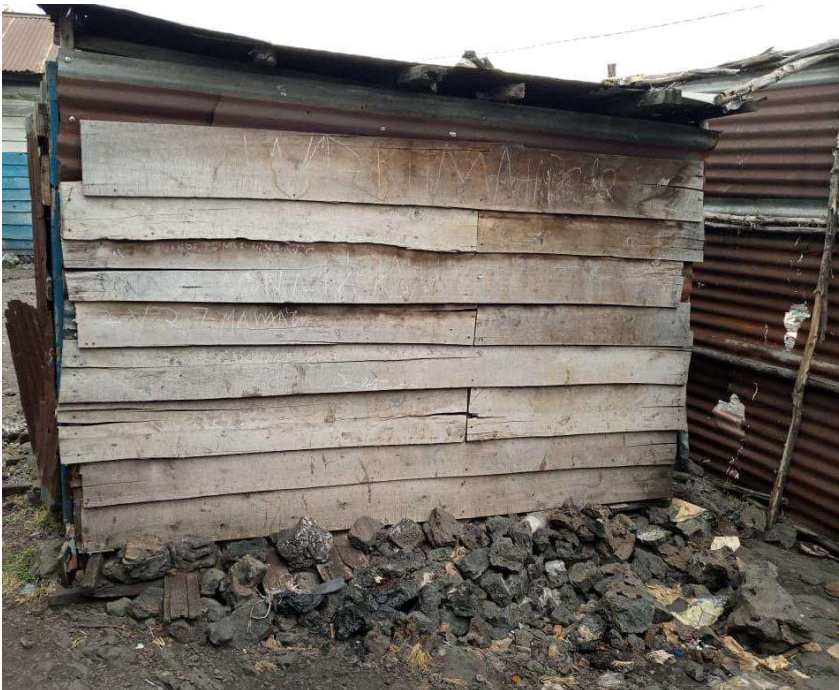
Backside of the school toilet.