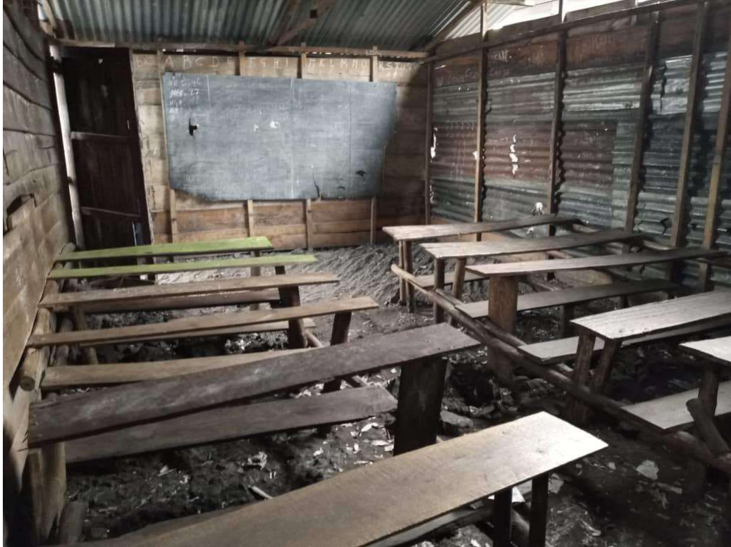
Inside the classroom. The benches are too old that it is risky for the students to sit on them. At any time a student falls off a bench, they are immediately injured because of the stony ground.