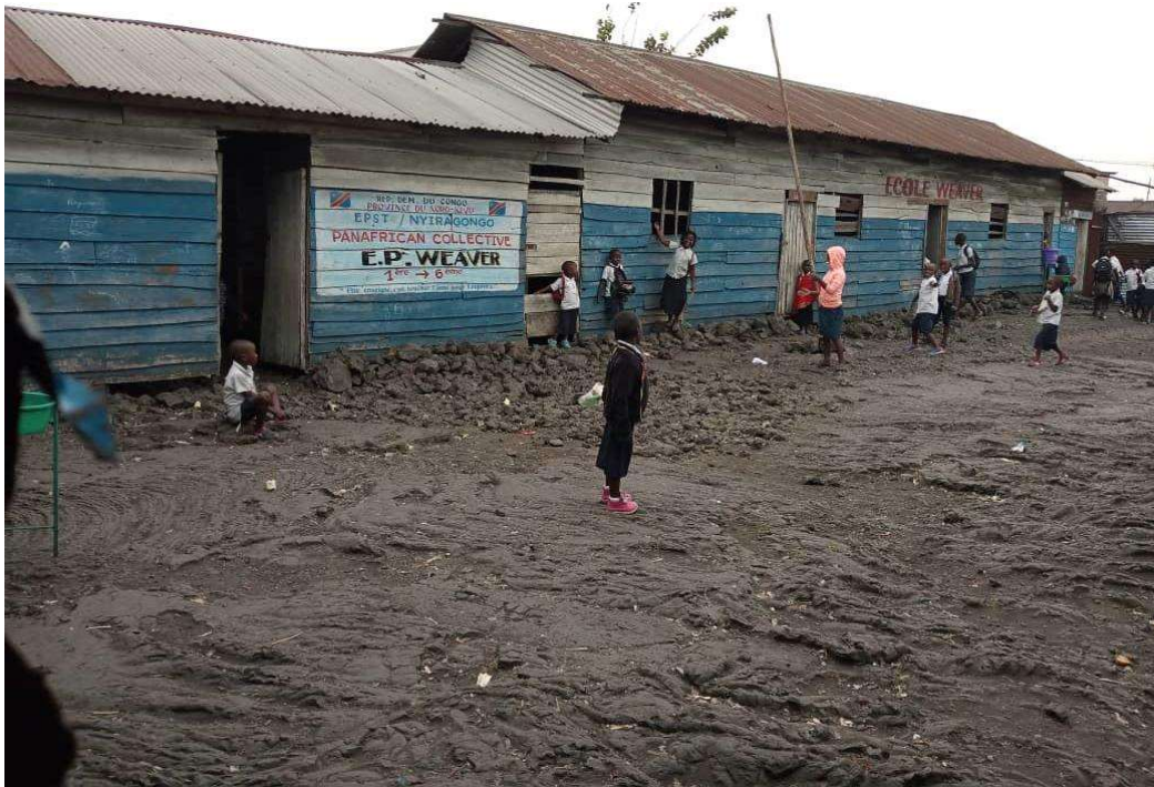
Outside of the school: No hand-washing buckets. There are few (3) but no longer of good usage. The school is likely be fined if it is visited by the Congolese Ministry of Health for not availing materials to fight against COVID-19.