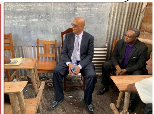
VISIT OF SCHOOL BEFORE LOCKDOWN

COMPILED ON THE DATE OF NOVEMBER 19 .2020